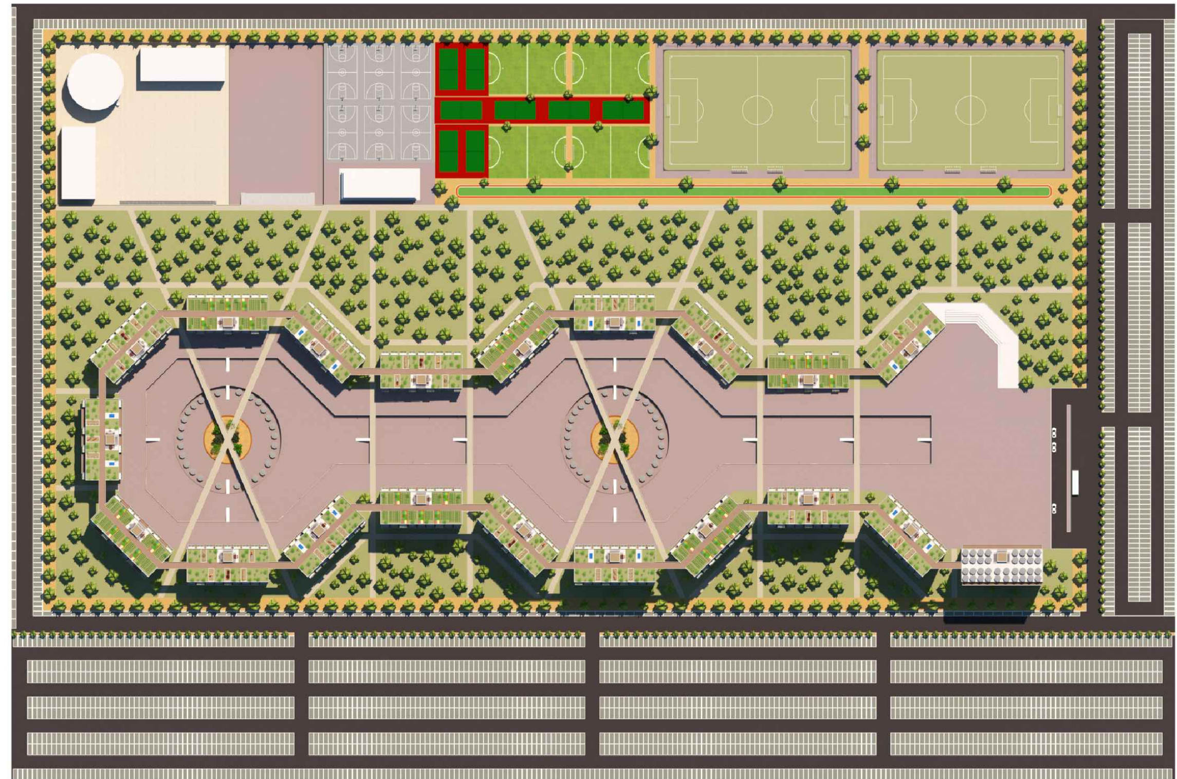
RENDERED PLAN VIEW