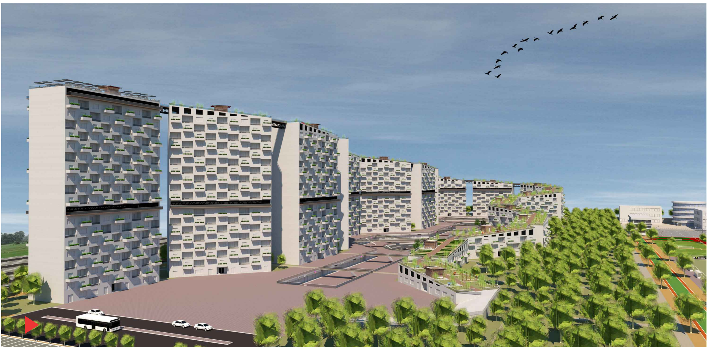
VIEW OF THE BUILDINGS FROM THE STREET SIDE