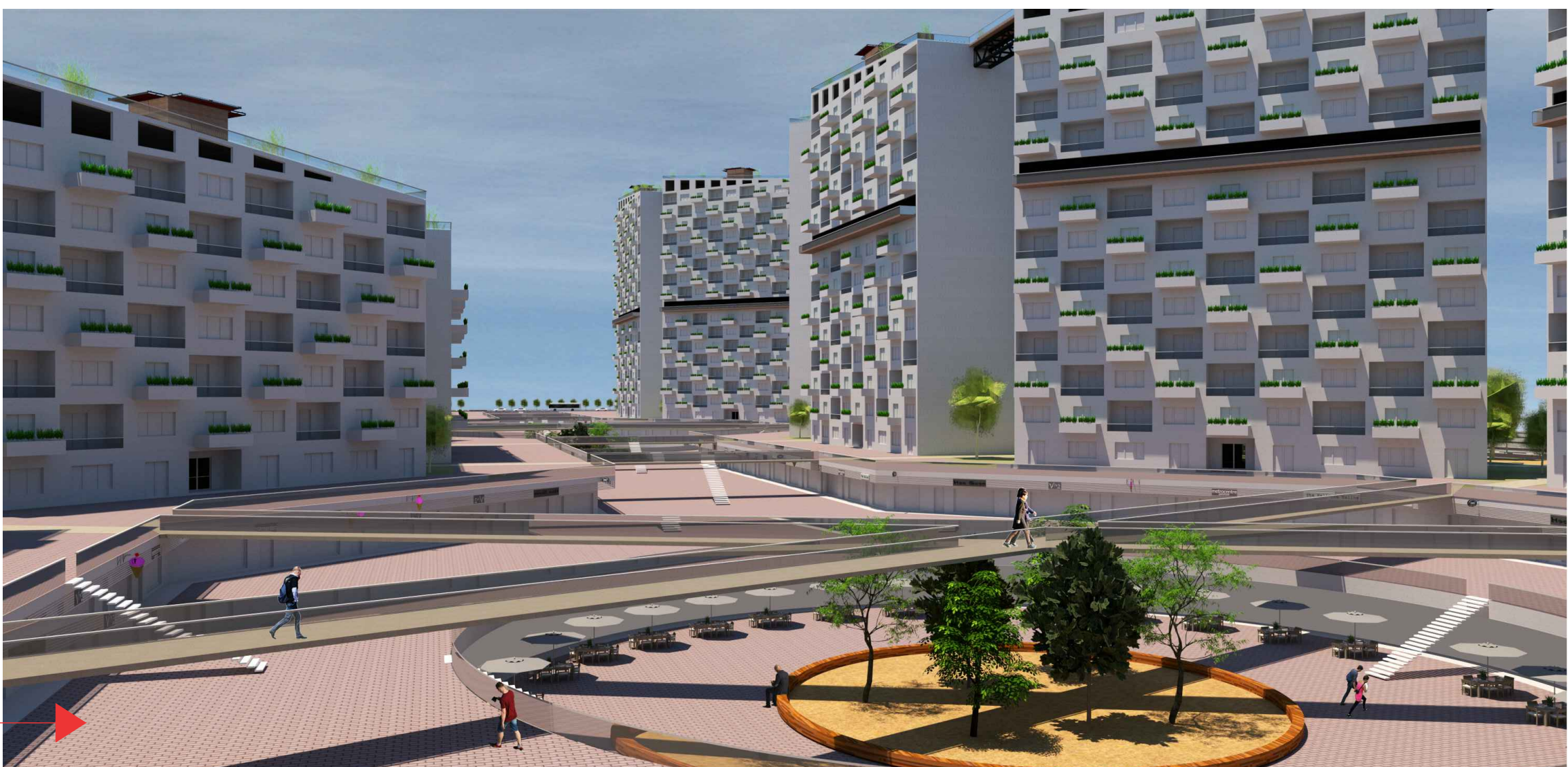
COMMERCIAL SPACES ON 2 SUNKEN LEVELS