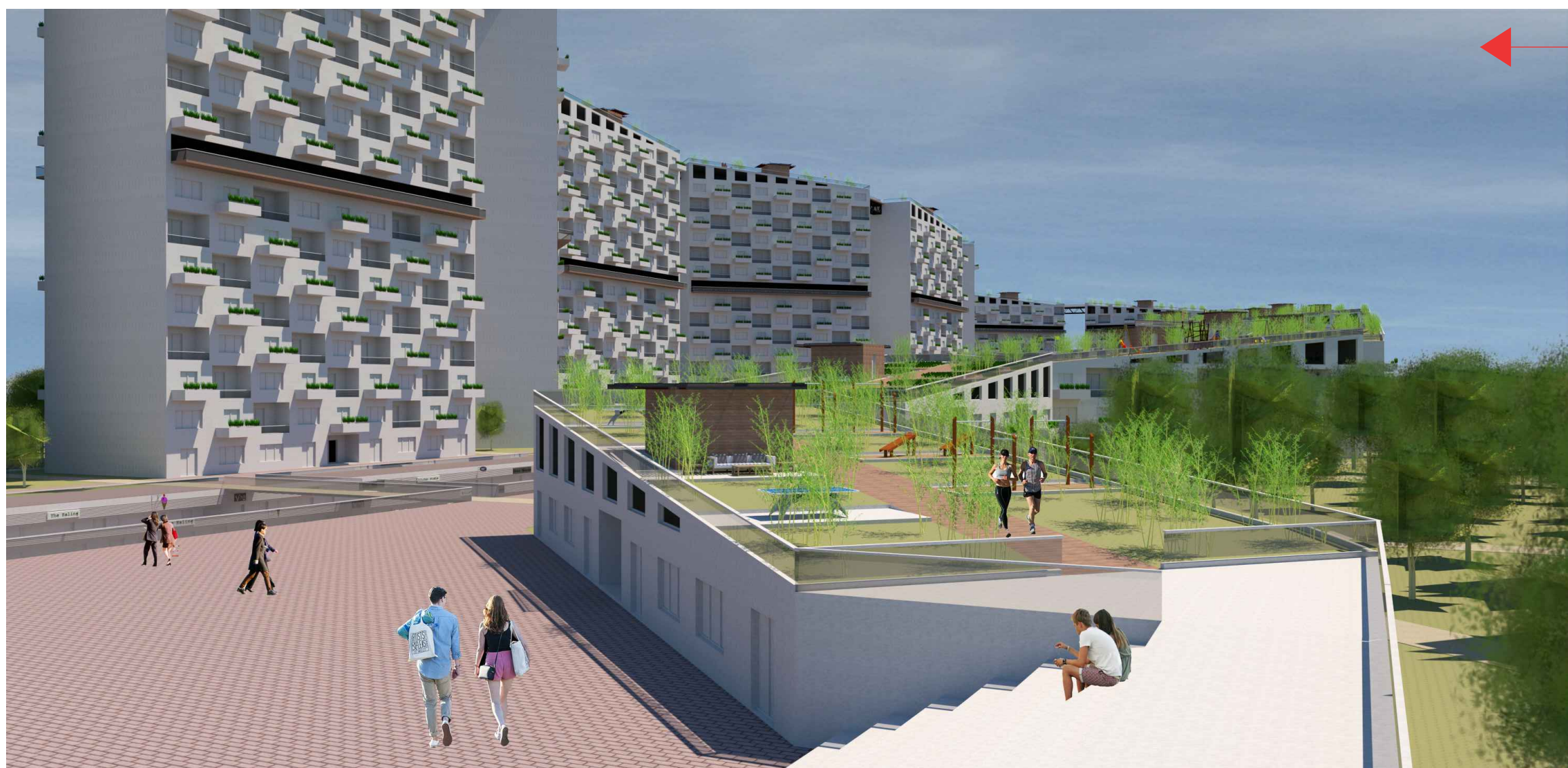
ROOF ACCESS FROM THE GROUND LEVEL