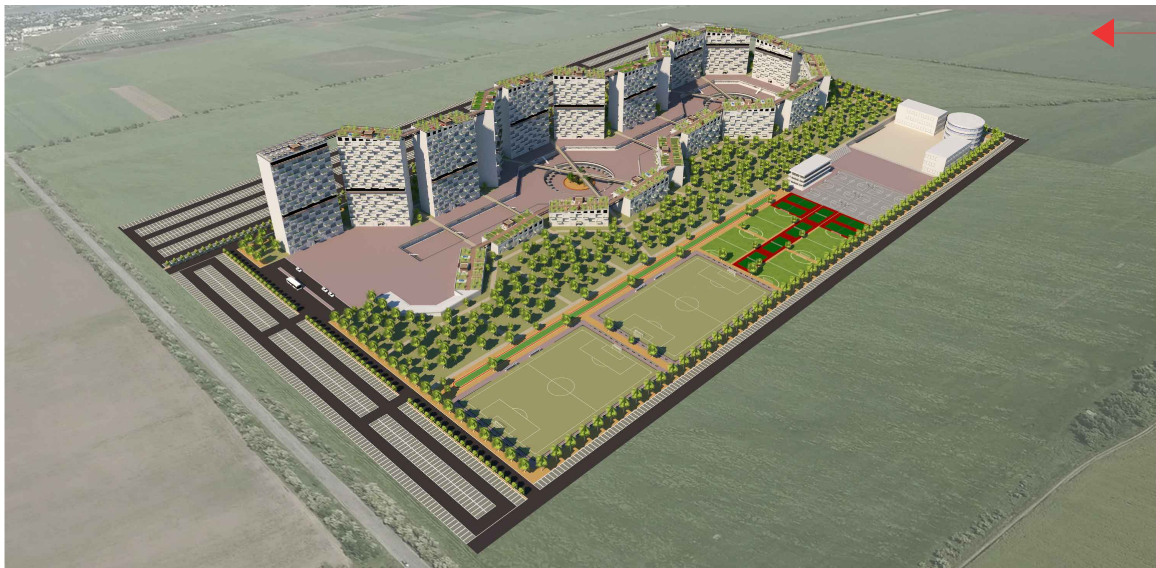
BIRD'S EYE VIEW OF THE COMPLETE DEVELOPMENT