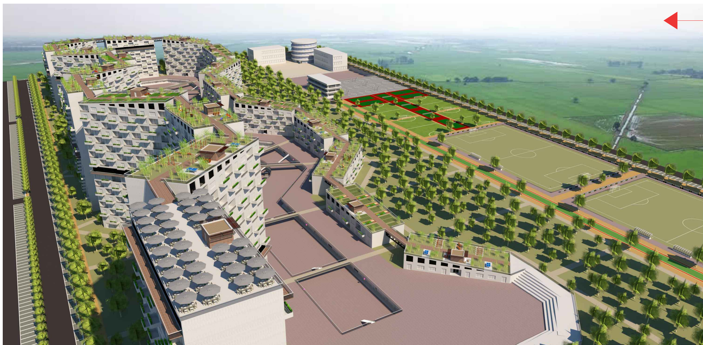
BIRD'S EYE VIEW OF THE LINKED ROOF GARDENS