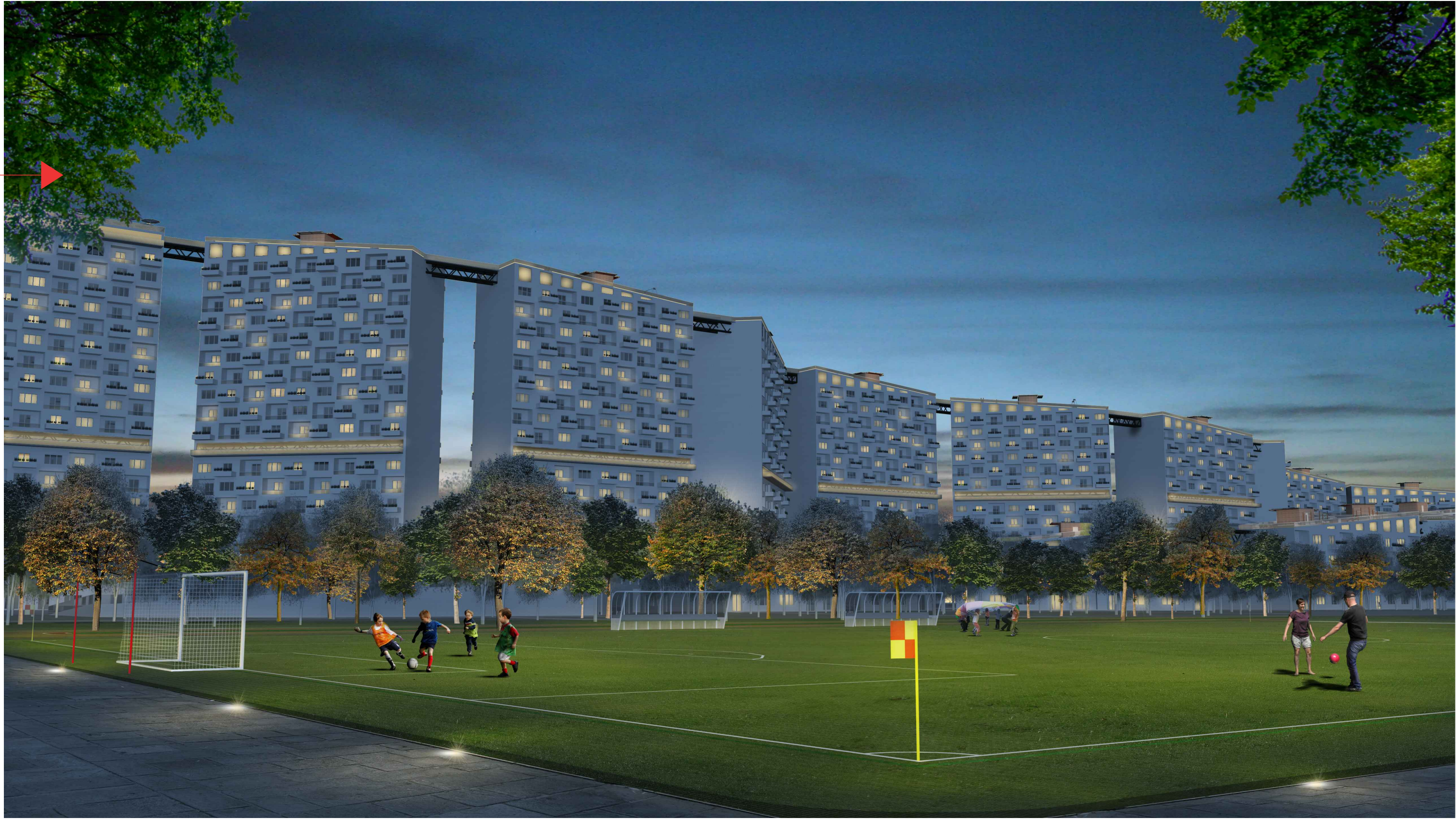
NIGHT VIEW FROM THE SPORT FIELDS