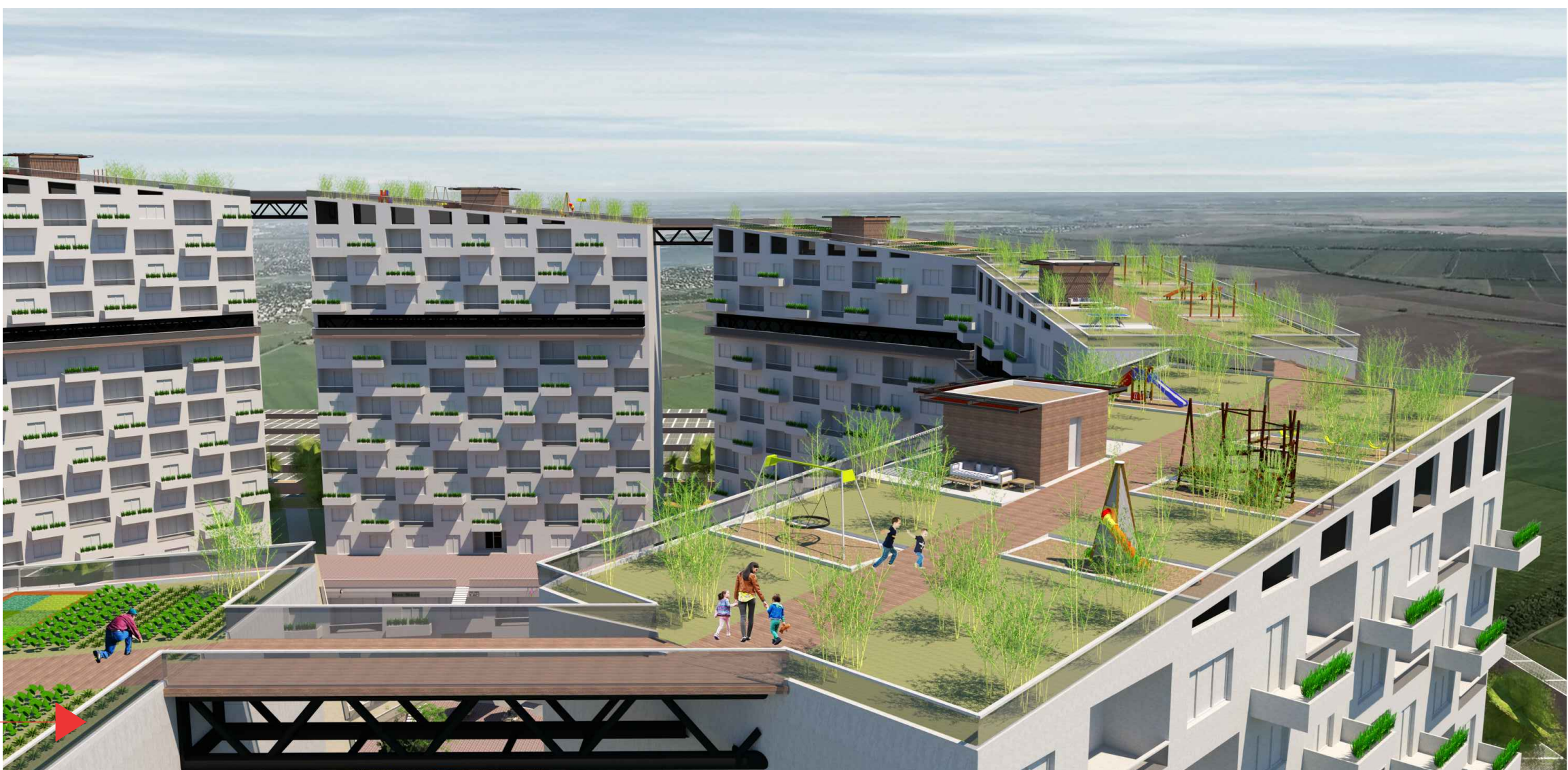
DETAIL VIEW OF THE ROOF GARDENS